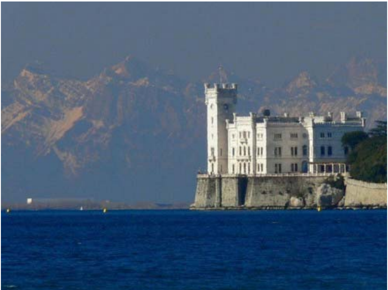
The Miramare Castle (built by Maximilian of Hapsburg Emperor of Mexico) with the Dolomites Alps behind, shot in a clear day – Trieste - Italy